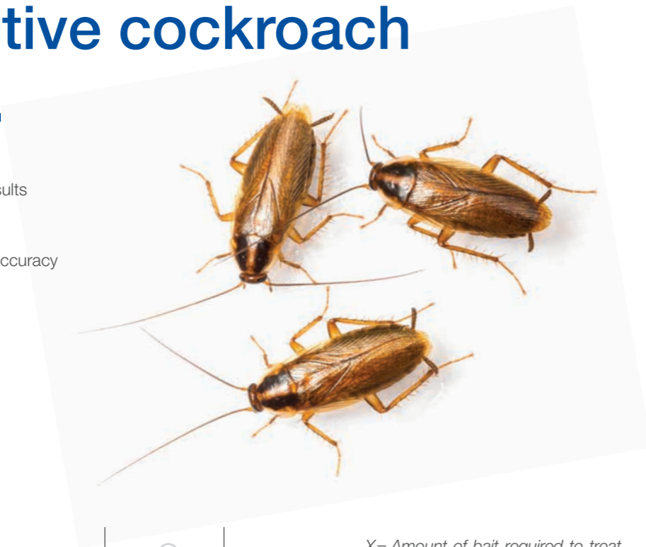
Comparison of Goliath® Gel dose rate with conventional gal baits.